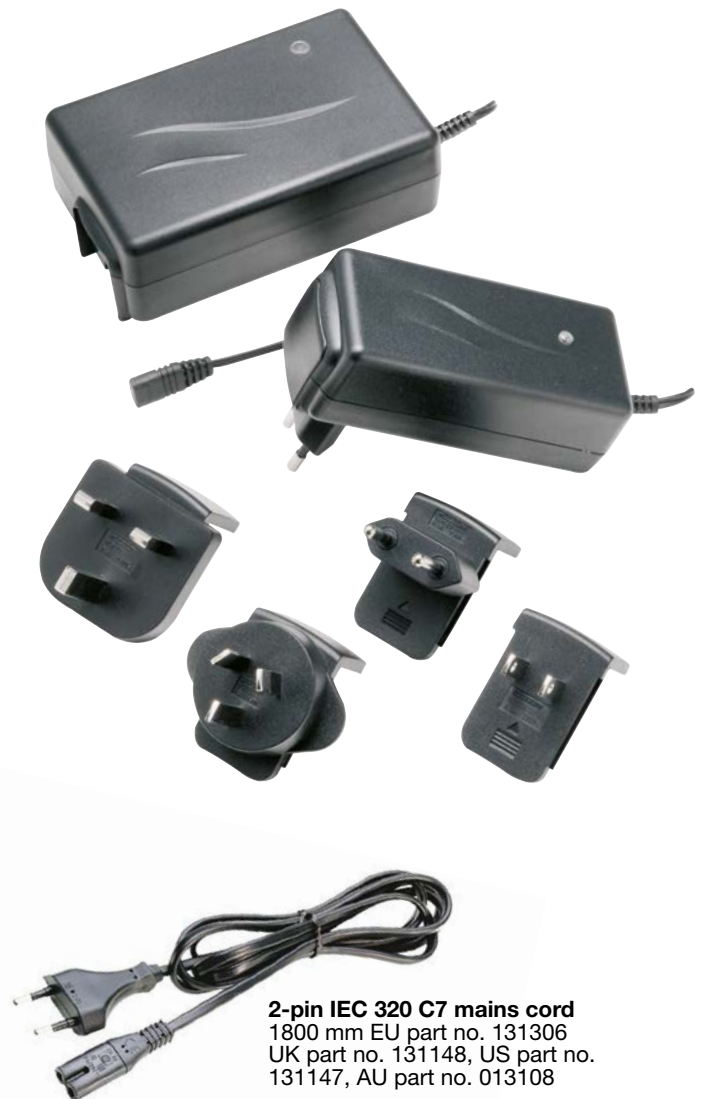
2-pin IEC 320 C7 mains cord 1800 mm EU part no. 131306 UK part no. 131148, US part no. 131147, AU part no. 013108